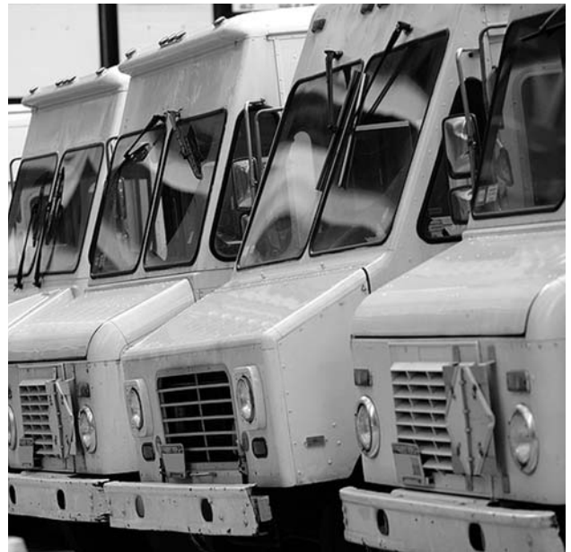
Z15.1 is developed around a framework of risk elements associated with motor vehicle operations. Basic management structure, driver considerations, vehicle considerations and operational considerations and methods to monitor and measure effectiveness are the foundations of this framework.

BH: There will be a more common understanding of what is meant by a driver safety or fleet safety program. This will undoubtedly make things less complicated for, as an example, organizations that require contractors to have a safety